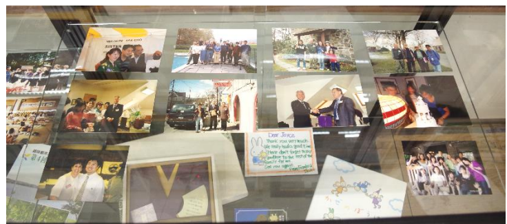
(Left) Books about Japanese folk tales and culture are stored