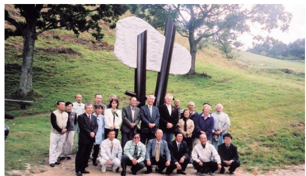
The monument unveiling ceremony in 2003

The venue, Elting Memorial Library, houses photographs and books that show the exchanges between the two cities to date.