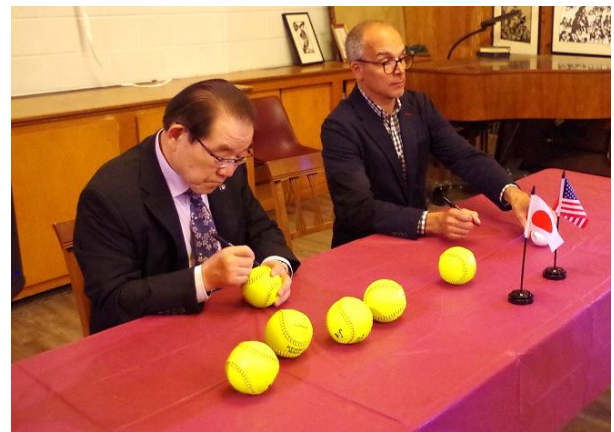
Sign and exchange of softballs