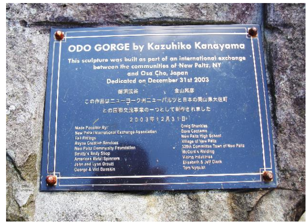
Monument: Odo Gorge