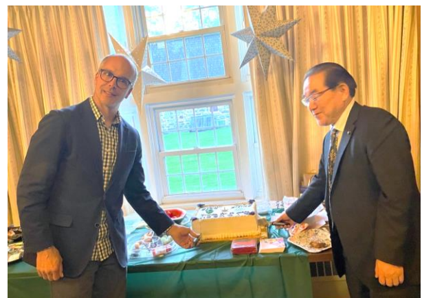
A welcome cake was prepared