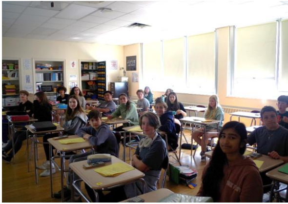
A lesson was held using scientific calculators.