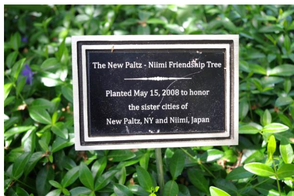
Friendship Tree Wood Panel