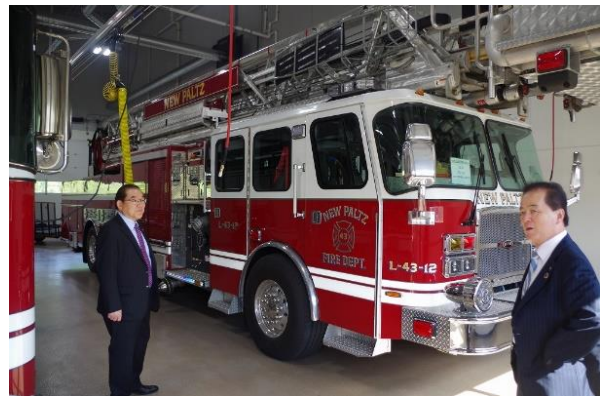
The new fire station will have ample space to accommodate large emergency vehicles.