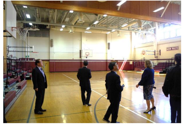
Tour of the gym