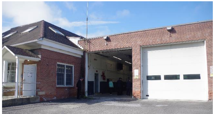
Former fire station equipment storehouse