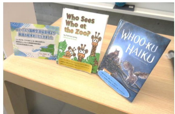
The two picture books we received from Ms. Sherburne can be read at the Central Library.