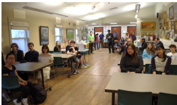
Everyone gathered at Elting Memorial Library