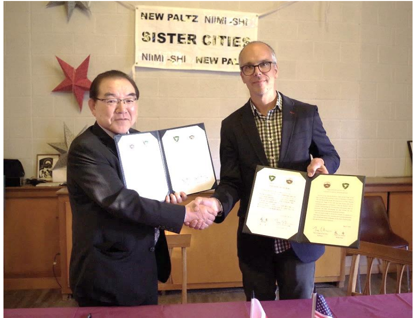
The mayors of both cities signed the "Confirmation of Sister City relationship Agreement"

In addition, party attendees signed softballs and each city shared three as a memento.